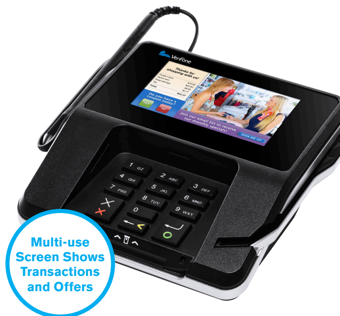
Multi-use Screen Shows Transactions and Offers