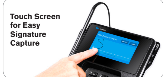
Touch Screen for Easy Signature Capture